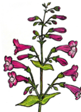
Canyon Penstemon, Penstemon pseudospectabilis by Jackie Blurton

Native plants are beautiful, hardy, need less water and provide habitat for wildlife.