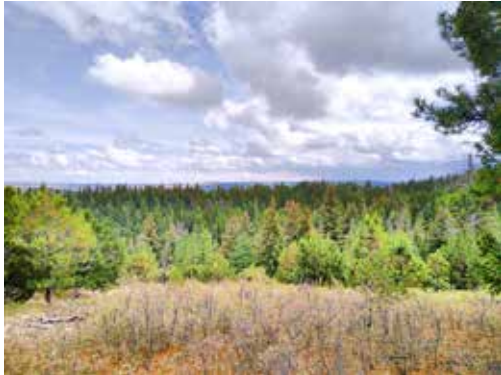
The view from the James Ridge Lookout.

Aug 12 Field Trip. James Ridge Lookout area (16 Springs). Summer is a great time for a hike in the forest north of 16 Springs. The area around the James Ridge Lookout has many flat roads and areas, and offers great views. Meet there at noon.