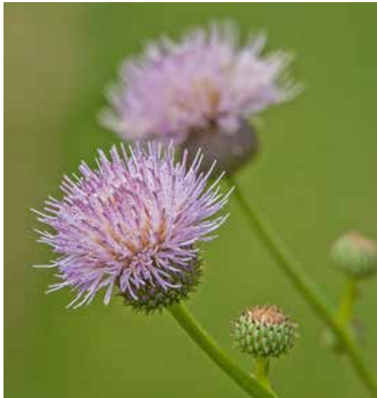
Wright's marsh thistle ( Cirsium wrightii ).