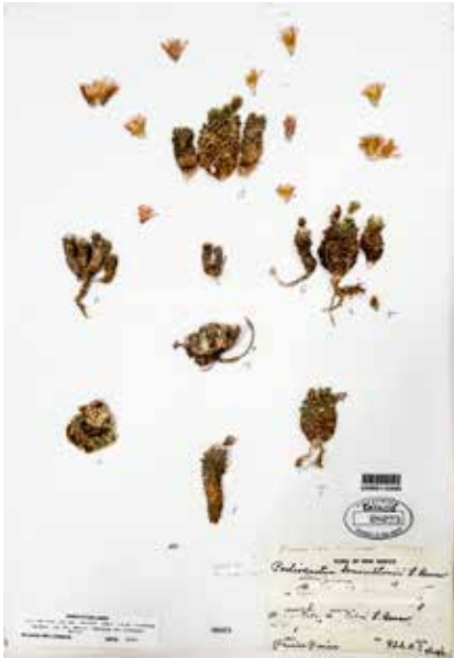
UNM Herbarium Specimen, UNM0116805. Collected by P. Prince (collection year not legible) in San Juan County. Collector's notes: On gravel hill. Flowers taken from garden 4/9/1962. Annotation label by Richard Spellenberg 3/1977: This specimen was the primary source for an illustration prepared for New Mexico's threatened and endangered species.