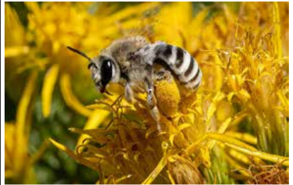
The Silva Creek Botanical Garden helps educate visitors about pollinators, such as this Tetraloniella Bee.

Now that we have a Master Plan for the Silva Creek Botanical Garden, we are proceeding with the first phase, which will entail managing water flow from the street along the north end of the garden so that we can create a wildlife thicket in that area. In this project we will have the help of the Town of Silver City, the expertise of the local firm Stream Dynamics, and the assistance of volunteers from the Youth Conservation Corps.