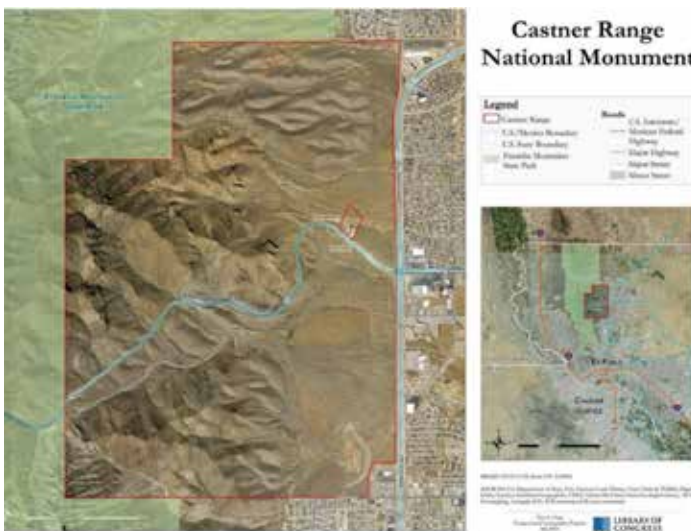
Castner Range map. https://castnerrange.org/reports-resources

"The local El Paso community cherishes the Franklin Mountains for their natural and ecological features. Castner Range remains an area of high biodiversity for desert species in America, including spring blooms of the Mexican Poppy. In addition to the poppies, this section of the Franklin Mountains also contains a high concentration of natural springs. Along with creosote brush vegetation, it provides important habitat to wildlife that call Castner Range home, including the American peregrine falcon, Golden eagle, mountain plover, Texas horned lizard, Black-tailed prairie dog, Baird's sparrow, and the Western burrowing owl. The endangered Sneed pincushion cactus and a host of other rare or endemic plants also inhabit the area. Protecting Castner Range ensures connectivity with other protected areas and migratory corridors for species to travel without the threat of human impacts."