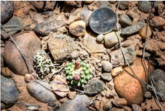
Pediocactus knowltonii in lower center of image. A US quarter at the top of the image and slightly to the right of the plant provides a sense of scale. As observed by Benson: "Mature plants range from the size of a quarter to that of a fifty-cent piece, and they blend into the rock mosaic around them or into the debris under shrubs."

and efforts to establish the species in alternate locations. These efforts to ensure viability of the species have included seeding and transplanting cuttings from established adult stems.