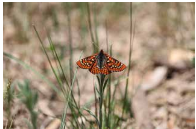
Sacramento Mountains Checkerspot Butterfly.

The U.S. Fish and Wildlife Service is finalizing its rule to protect the Sacramento Mountains checkerspot butterfly as endangered under the Endangered Species Act. The ESA defines endangered as a species that is currently in danger of extinction throughout all, or a significant portion of, its range.