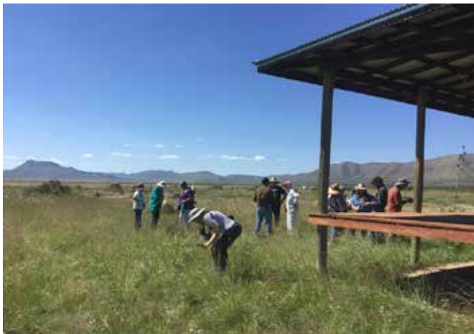
Above: Participants from the Texas Native Plant Society 2022 Annual Meeting search for plants during The Nature Conservancy's Marathon Grasslands Preserve Field Trip. Sign up for F-01 to explore the Marathon Grasslands this September.