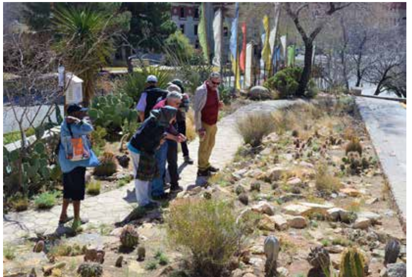
Members of the public and the El Paso Chapter of the NPSNM talk about the cactus garden during a tour of the Chihuahua Desert Garden, University of Texas, El Paso, in early March, 2023.