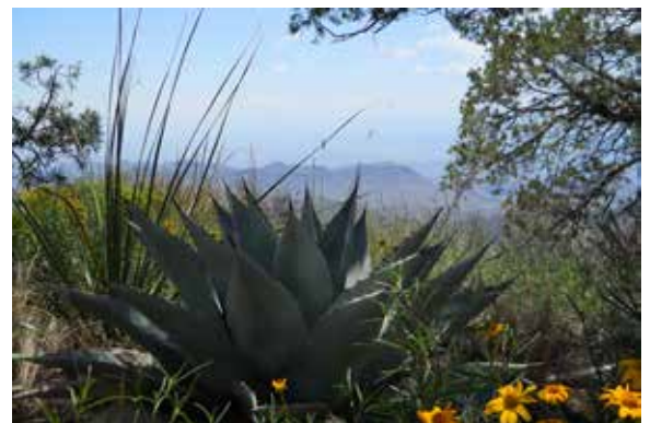
Right: This High Chisos Vista shows the wide range of vegetation you'll see in the Big Bend National Park. Sign up for F-05 to hike in the plants in the Chisos Basin or for F-06 to drive through even more of the area.