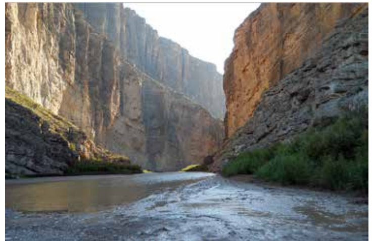
Above: The Santa Elena Canyon is one of the beautiful landscapes that make up Big Bend National Park. Sign up for F-06 to drive to it and take a short walk to the mouth of the canyon. There's a possibility that those on F-05 will have time for the same short walk.