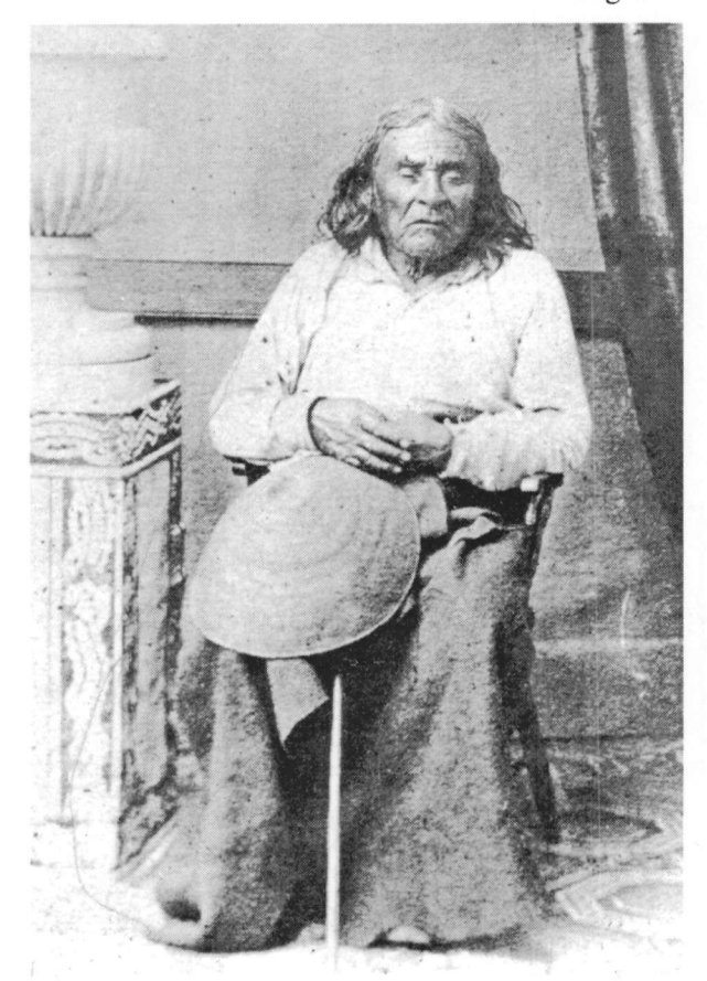
Photo of Chief Seattle (1864) the wild horses are tamed, and the view of the ripe hills blotted by talking wires. Where is the thicket? Gone. Where is the eagle? Gone. And what is to say goodbye to the swift pony and the hunt? The end of living and the beginning of survival. So we will consider your offer to buy the land.

That destiny is a mystery to us, for we do not understand when the buffalo are all slaughtered,