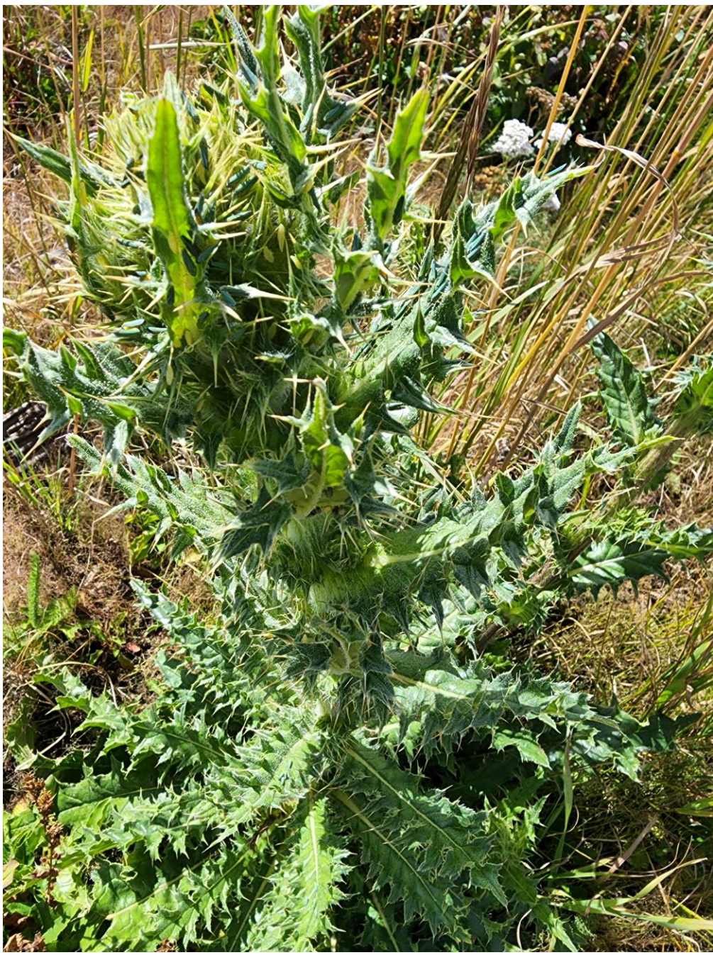
Figure 3. The strange thistle found in 2022 near the top of Mogollon Baldy it was not found again in 2023