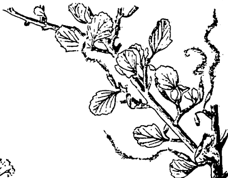
Rose family (Rosaceae)