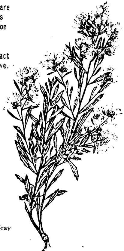
EMORY BACCHARIS Baccharis emoryi Gray

Additional plants are to be found in this area. The list from Dan contains about 125 species. For complete list contact Dan at address above.