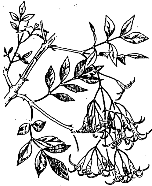
Drawing by Robert DeWitt Ivey

and strongly attenuated or pointed at the tip, hence the origin of the term "cuspidata." The fertilized flowers set papery seeds known as samaras; hard flattened nutlets partially surrounded by a long, tapered, somewhat flexible "wing" that aids in wind borne dispersal.