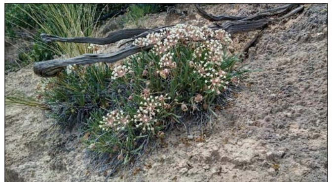
Abronia bigelovii