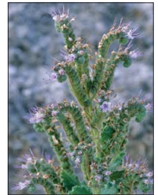
Left: Mentzelia todiltoensis ; Right: Phacelia sivinskii