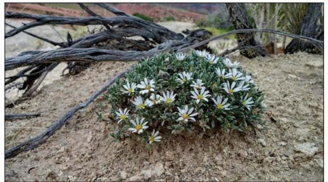
Townsendia gypsophila

mountain biking in the White Mesa area have prompted the need for a more thorough knowledge of the abundance and distribution of four rare plant species endemic to gypsum soils in the White Mesa area northwest of Albuquerque. The New Mexico Forestry Division completed surveys for Townsend's gypsum aster ( Townsendia gypsophila ), Sivinski's scorpionweed ( Phacelia sivinskii ), tufted sand verbena ( Abronia bigelovii ), and Todilto stickleaf ( Mentzelia todiltoensis ) on BLM and Zia Pueblo lands in 2015. Continued page 9