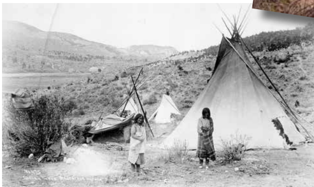
1890-1910. Mescalero Apache women.