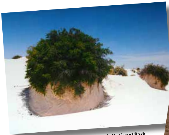
Gypsum plant stands in White Sands National Park, NM. (Skunkbush sumac)