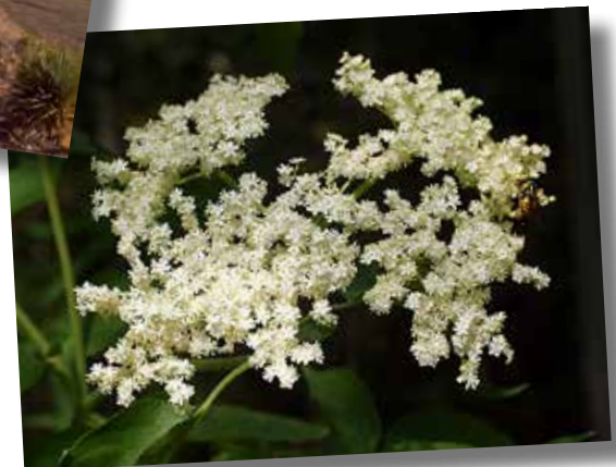
Sambucus caerulea var. neomexicana